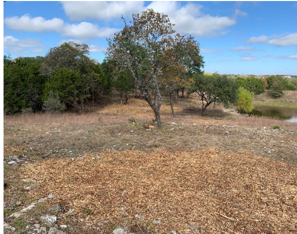
Before and after pictures from applicant mulching 2.49 acres