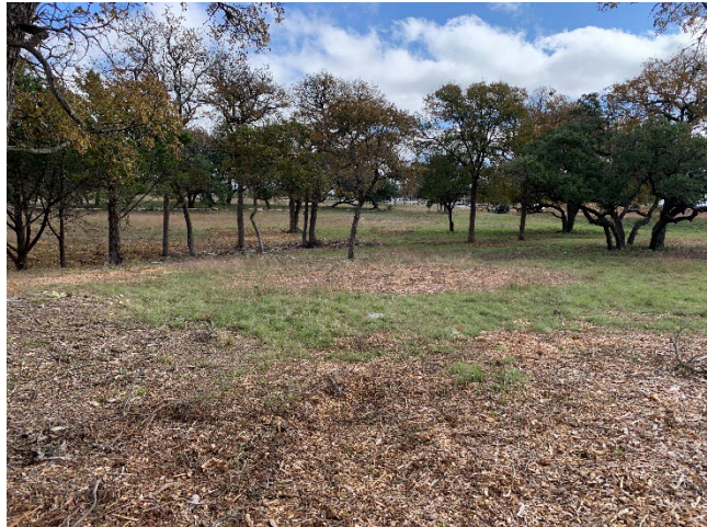
Before and after pictures from applicant mulching 2.49 acres