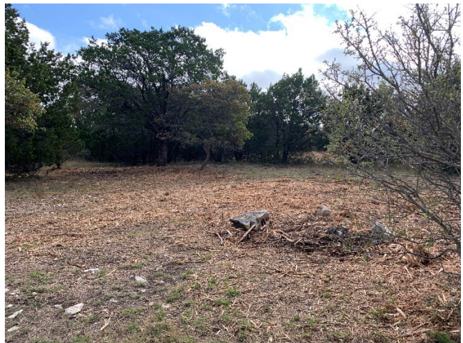
Before and after pictures from applicant mulching 5 acres