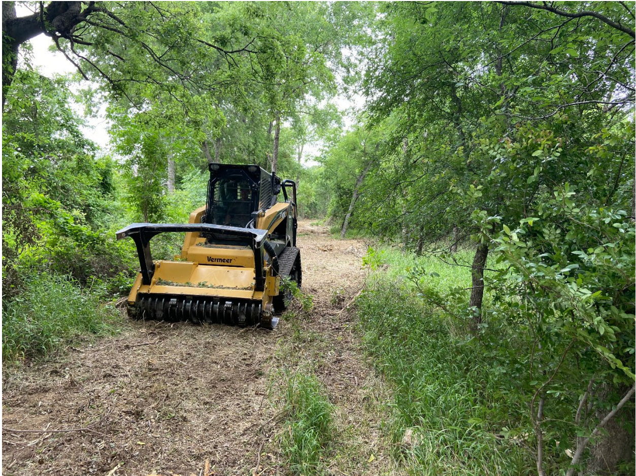
Figure 1: Mulcher inputting a shaded Fuel Break.